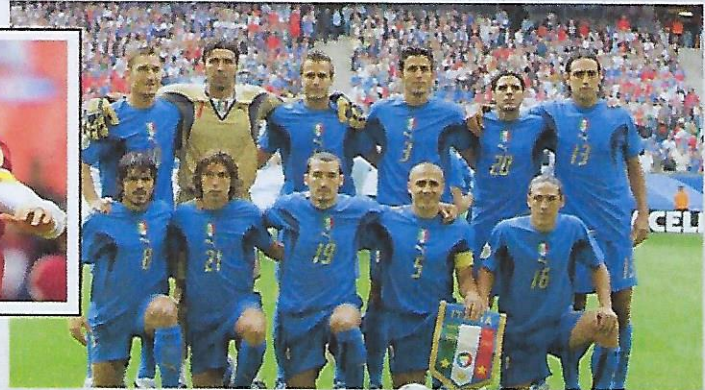
2006 World Cup Winners

Location: Charlottesville's Functional Forum Meetup at AquaFloat or by LIVE WEBINAR